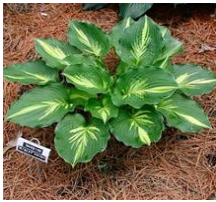
Lakeside Paisley Print

The 2015 Garden Expo is from Feb. 13 – 15 this year, just a few short weeks away! We're looking for volunteers to help in the Wisconsin Hosta Society booth. The Garden Expo offers an excellent opportunity to share our passion for hostas and attract new members. We will also be selling 15 different varieties of hosta this year so we expect a lot of visitors to our booth.