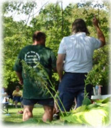
Doing the "Shimmy Shake."