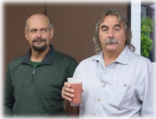
Green Bay.....or Chicago?