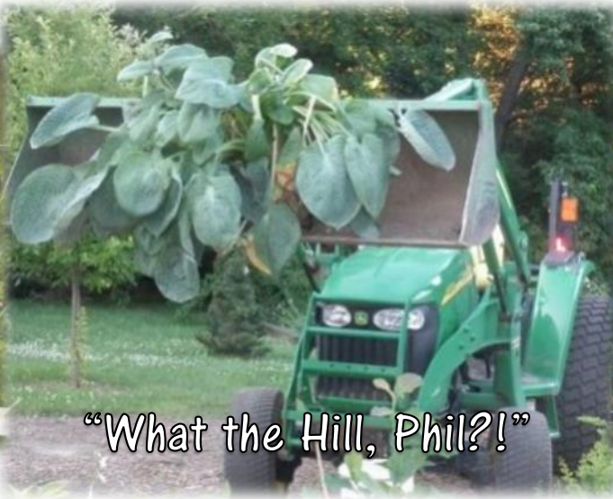
"What the Hill, Phil?!"